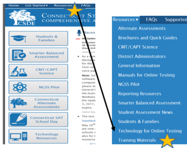
Figure 1. Snapshot of the Connecticut Comprehensive Assessment Program Portal Resource Tab

For starters, however, we are pleased to present the 2018 Interim Webinar Series with two videos just released. A PDF of each webinar is also available on the Student Assessment Smarter Balanced Interim Assessment Web page and on the Connecticut Comprehensive Assessment Program Portal under the Resources tab (See Figure 1 below). The yellow stars indicate where these resources are posted.